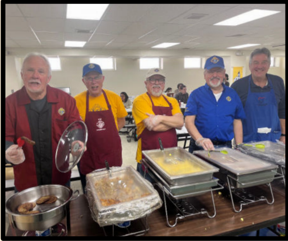
Breakfast is now being served

All Saints Council 4240 generously served breakfast to support the parish ministries following a successful church drive at Saint Mary Parish Menomonee Falls.