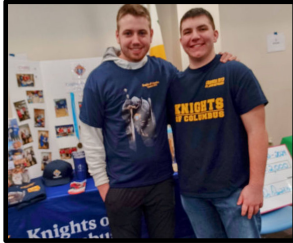
Round Table Makes the News!

All Saints Council 4240 generously served breakfast to support the parish ministries following a successful church drive at Saint Mary Parish Menomonee Falls.