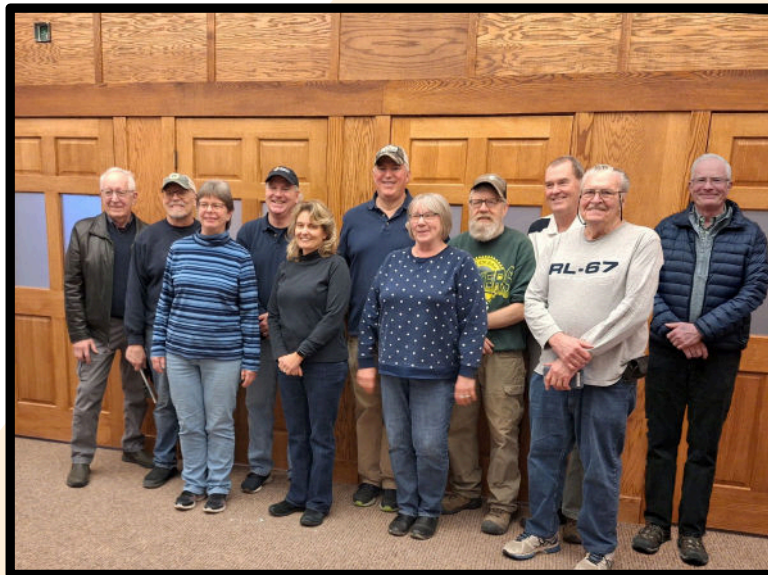
Construction crew pictured L to R:

The confessionals were scheduled to be completed by Easter Sunday, which was a significant milestone for the Church. The project's success was a testament to the Council's dedication and hard work, and it was a source of pride for the entire community.