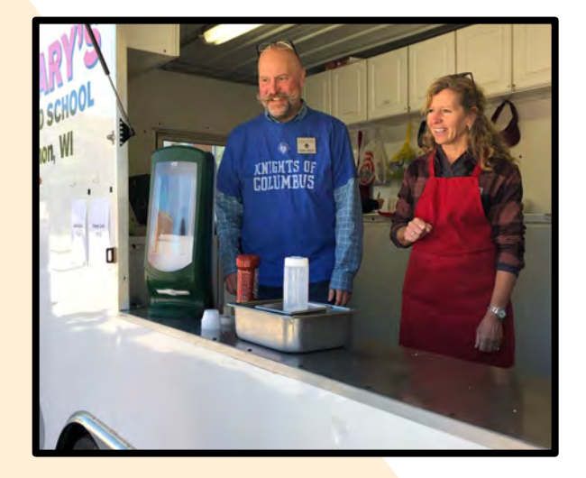
Queen of Apostles Council 16280 Marathon ran another successful cheese curd stand during the recent Festival of Arts weekend.