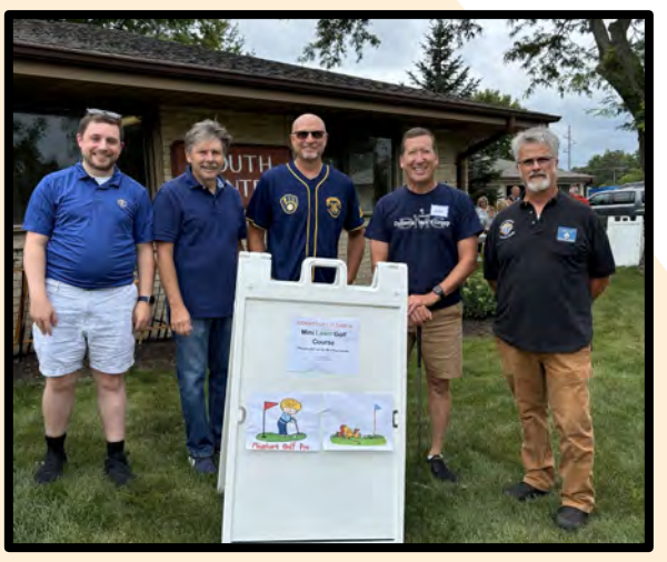
Knights of Columbus Council 6448 members coordinating a mini lawn golf event during a recent parish picnic.

25 Knights from Council 4648 in Brookfield built 44 bunkers for the Sleep in Heavenly Peace build-a-bed project. Bunkbeds will go to local families whose children don't have a bed to sleep in. Beds will be delivered, including all the bedding needed, at no cost to the family.