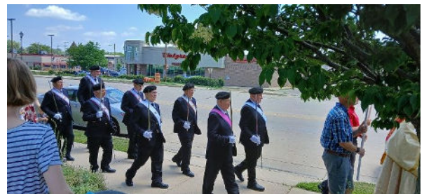
Fourth Degree Knights lead a Corpus Christi Procession in Watertown, WI.

and November at various locations. Type in Honor Flights in Wisconsin into your browser and look them up for specific details. Be there to welcome back our veterans when they return from their visit to Washington DC and the various Memorials.