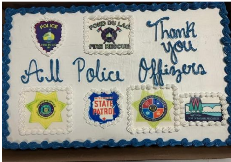
Pictures from Public Service Night with 100+ people present.